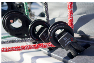
U-Block with Double Loop attachment